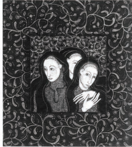
Melancholy, Sadness and Denial, 2005-06 8 x 8 inches, ink, acrylic, goldleaf on panel