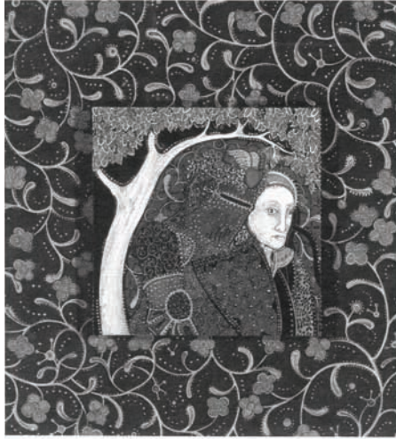
The Knight of Love, 2005-06 8 x 8 inches, ink, acrylic, goldleaf on panel